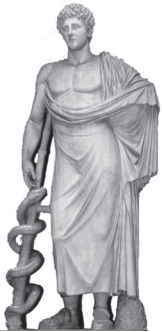
Rod of Asclepius

Good question. Recall that an airline flight attendant's pre-flight instructions tell us to put our own oxygen mask on first before helping a child. Airliners fly five or six miles up where oxygen is so scarce a person can easily lose consciousness. If you were to put the mask on a child first, you might become unconscious before you could put on your own mask.